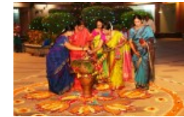
Lanco Hills celebrated Bathukamma with traditional festivities