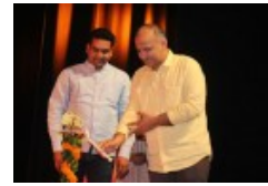
Delhi Classical Music Festival Takes off To Fabulous Start