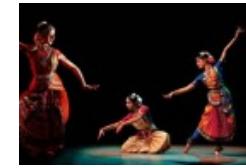
Ministry Of Culture, Government Of India Inaugurates Rashtriya Sanskriti Mahotsav