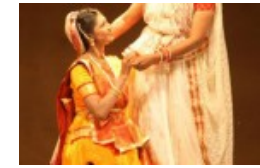
An initiative by the women, for the women..!